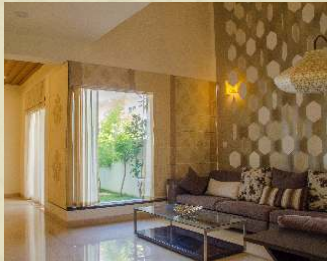
Shot at site

The contemporary design will appeal to the globetrotter in you. At Nature Walk each home is fitted with every modern convenience necessary to ease your day to day life. Incredibly enough, each home is designed allowing for nature's forces to augment your health and well-being for years to come. Plenty of sunlight enters every room and through the large glass windows facing your private garden. The stone pathways and central green boulevard an old world charm to the whole setting while you keep pace with life, in style and calm.