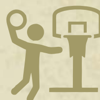
Half basket ball court